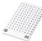
Marker card, Card, white, labeled, Horizontal: Consecutive numbers 1 - 10, 11 - 20, etc. up to 91 - (99)100, Mounting type: Adhesive, for terminal block width: 5 mm, Lettering field: 5 x 3.8 mm

Marker card - SK 5/3,8:FORTL.ZAHLEN - 0804183